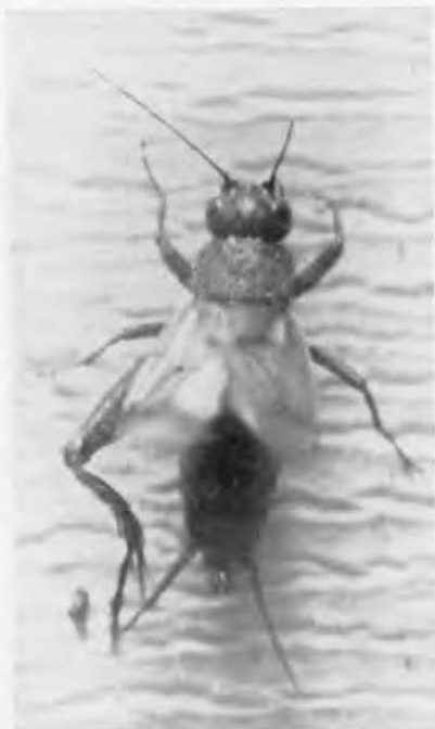
Stroboscopic picture of cricket with wings raised in "singing." Taken with a Leica Camera, exposure 5 seconds, stroboscope flash speed 16\frac{1}{2} per second

Insect noises are not produced vocally, but are produced by friction of one part of the body against another, by vibrations of the wings, by vibrations of a muscularly-controlled diaphragm, or by tapping the body on some external object. The cricket has small wing covers, or tegmina, which, according to biologists, are not adapted for flight. It is these wings which rub on one another to produce the "song." It is the male alone who "sings" or stridulates, the female possessing no stridulatory organs. Sometimes he sings alone with no female at hand, and at other times he sings while quite obviously trying to interest her, but she is at all times silent, appearing rather indifferent to his long trills. After a prolonged song of sometimes half an hour, the male is seen to perform a sort of dance, chirping excitedly, and the female, standing a short distance from him, will then execute back-and-forth